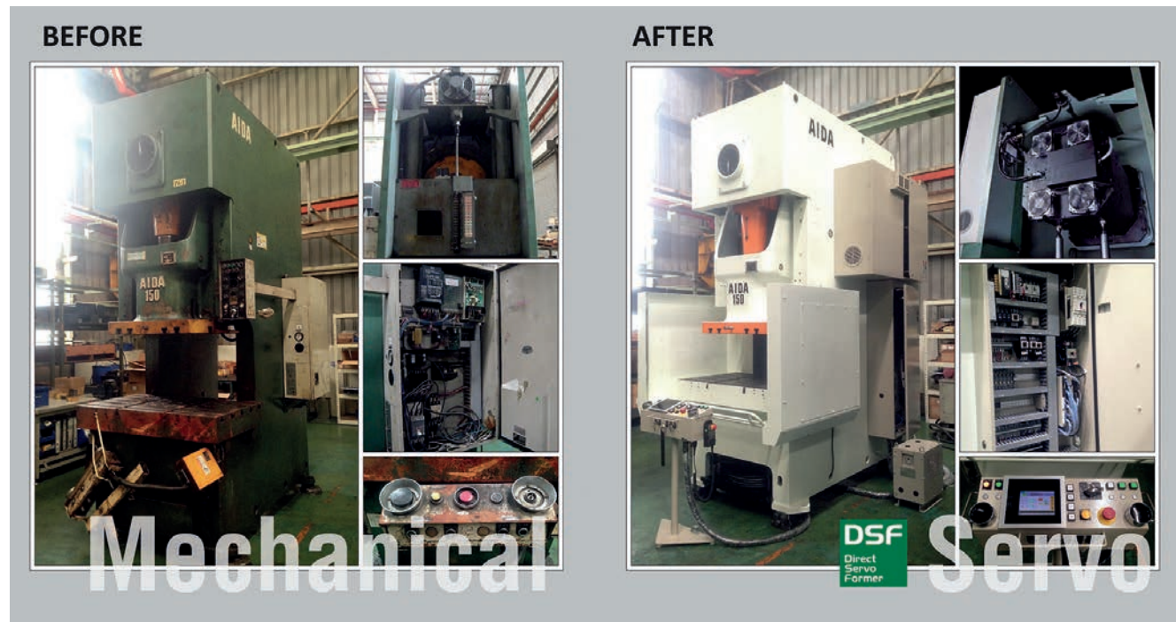
*Servo Press Conversion by AIDA Self-developed low speed high torque servo motor

AIDA is committed to provide the best support to customers for press equipment needs, and that includes reliable spare parts and accessories. To ensure customers in Asia have easy access to these vital spare parts, AIDA has set up a dedicated spare parts supply centers in Singapore, Malaysia, Thailand, Indonesia, India, Vietnam, and the Philippines. This comprehensive supply network ensures all major spare parts and accessories are readily available for immediate deliveries. AIDA understands the importance of having access to reliable spare parts and accessories and takes pride in maintaining an extensive inventory of high-quality products that are ready to ship immediately. With a fast and efficient response, customers can get the parts they need to keep their press equipment operating at peak performance in no time.