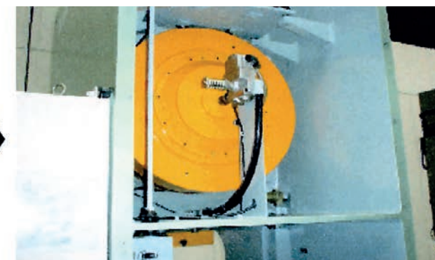
Wet Type C&B